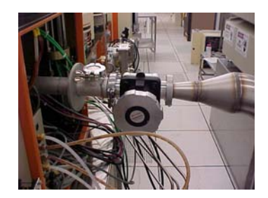
NanoFab, University of Alberta www.nanofab.ualberta.ca

3.9 Once the gas is flowing, the pressure needs to be adjusted. Using the butterfly valve located at the rear of the tool, open or close the valve until the desired pressure is reached (open to decrease pressure, close to increase pressure).